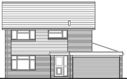
Front (south) elevation