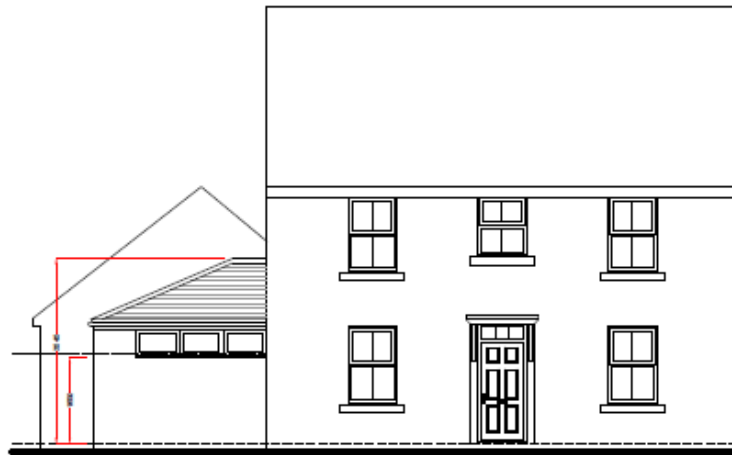
PROPOSED RIGHT ELEVATION