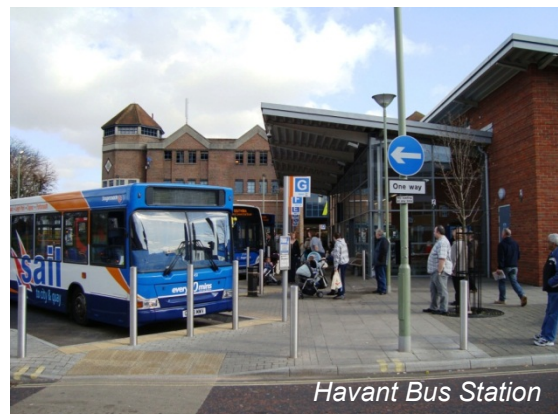
Havant Bus Station

3.03 Havant Town Centre offers the widest choice in alternative transport with a mainline train station, serving a variety of locations and a bus station that provides services across the Borough and to Portsmouth, Chichester and beyond. Havant Town Centre also provides a range of shops and services which lessen the need for individual travel. This is considered to be the most accessible and sustainable part of the Borough.